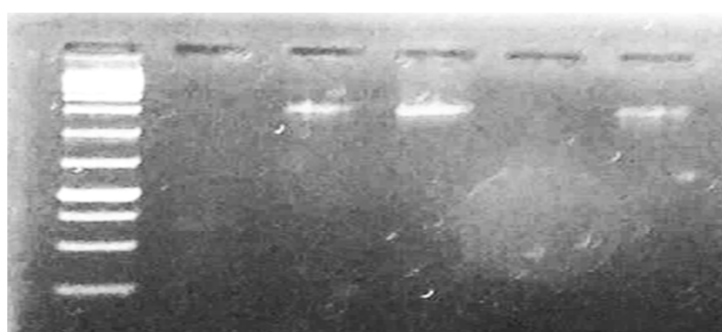
Fig 4. 16S rDNA amplicon of actinomycetes isolates

of the 16SrRNA gene for the isolates that match with the information in the NCBI Genbank, showed the similarity of the isolates to the antibacterial actinomycetes group. The isolate W2 showed 95.9% similarity with Streptomyces sp., the isolate W5 shared 95.9% to Micromonospora auratinigra strain SB29 and W11 similarity 98% with Streptomyces carpaticus strain PES-A23 (Table 2).