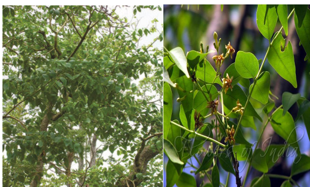
Figure 2 Homalium zeylanicum Plant