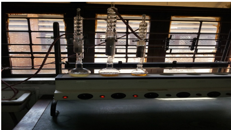
Figure 1 Extract preparation by Soxhlet apparatus.