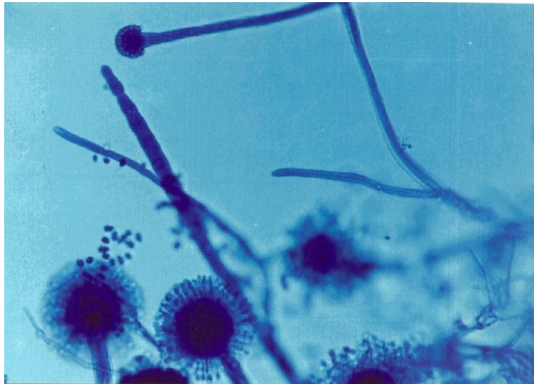
Table/ Figure - 2 LPCB mount of Aspergillusflavus