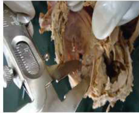
Figure - 2 Measuring the leaflets of mitral cusp