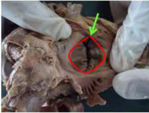
Figure - 1 Exposing the mitral Valvular components trough left atrium

The left atrium and the left ventricle were cut along the left border of the heart and exposed, taking care not to injure the valve. All the above mentioned parameters were taken by suspending the heart in a gauze cradle (Fig – 2).