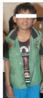
Figure No.2 shows the clinical manifestation of haemoglobinopathies:- Girl with sickle cell anaemia having vascularocclusion in right leg. Boy with beta-thalassaemia having discoloured skin and splenomegaly