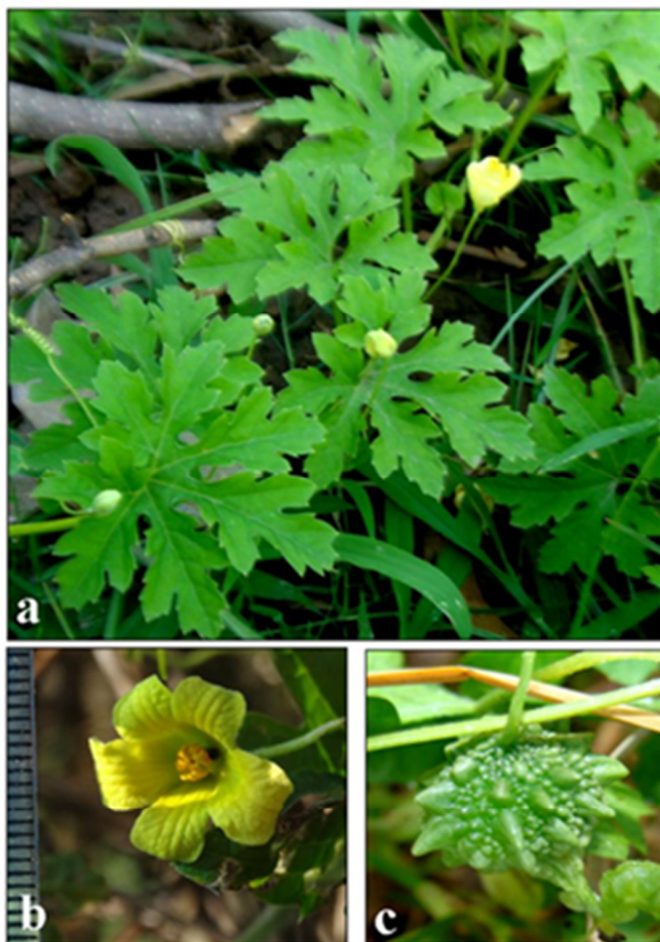
Figure 1 Morphology of Momordica charantia var. muricata a. A vine growing on wasteland, b. A full opened male flower, c. A fruit

Secondly, var. muricata can be promoted as an alternative crop for its excellent culinary traits which can improve livelihood of poor farming communities. Besides, government should also promote this delicious fruit bearing variety by giving incentives to the farmers for its cultivation. In fewer areas of West-Bengal, Sikkim, Kolkata, Andaman and Nicobar Islands and Tamil Nadu, cultivation of var. muricata is being promoted by locals with the assistance of some private seed companies. 12 Similar trend needs to be extended by non-government organizations of our state for enriching the germplasm of wild bitter melon.