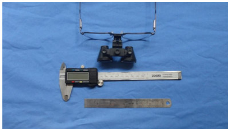
Figure 1 Showing the armamentarium